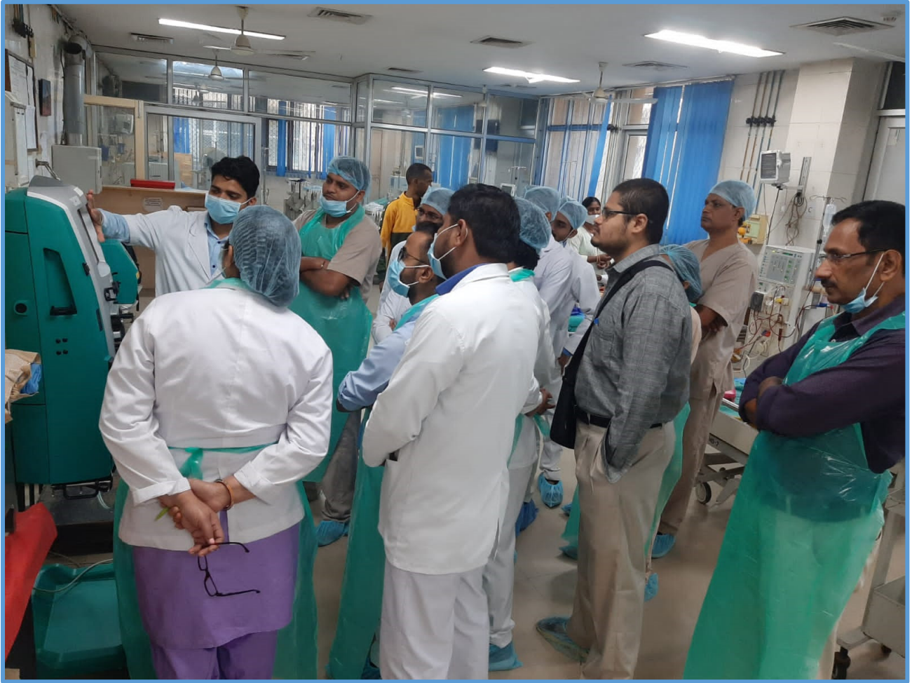
Senior technical officer explaining students and Nursing staff practical aspects of dialysis modalities