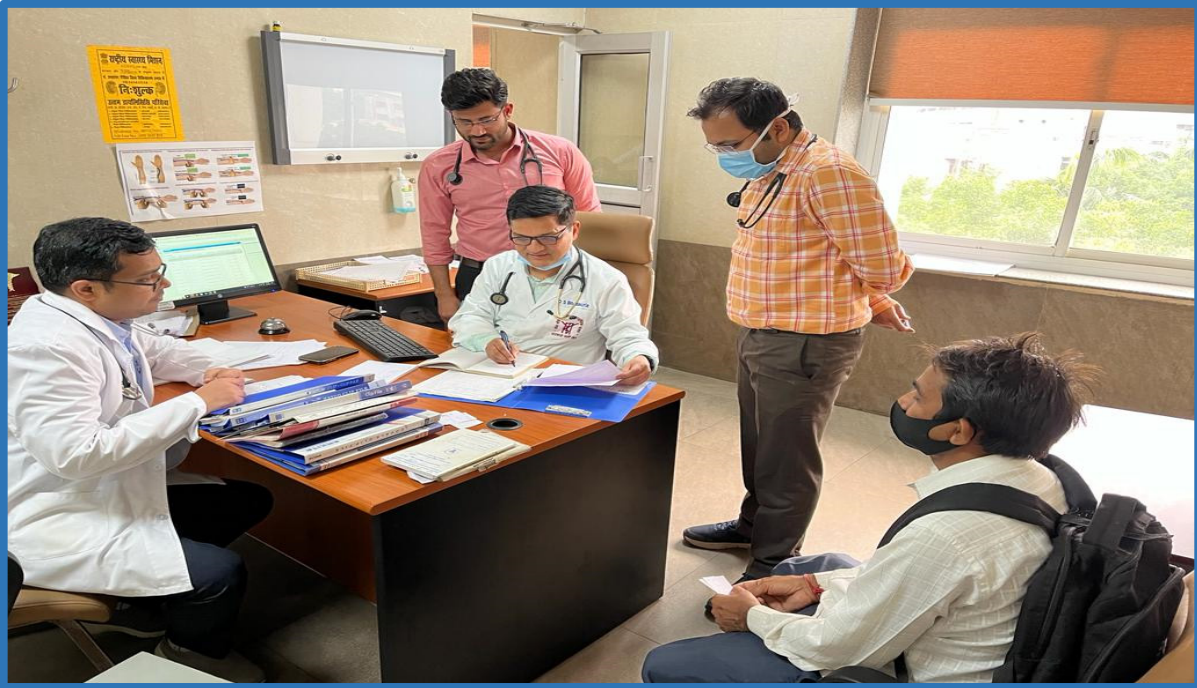
Teaching learning through case discussion in OPD