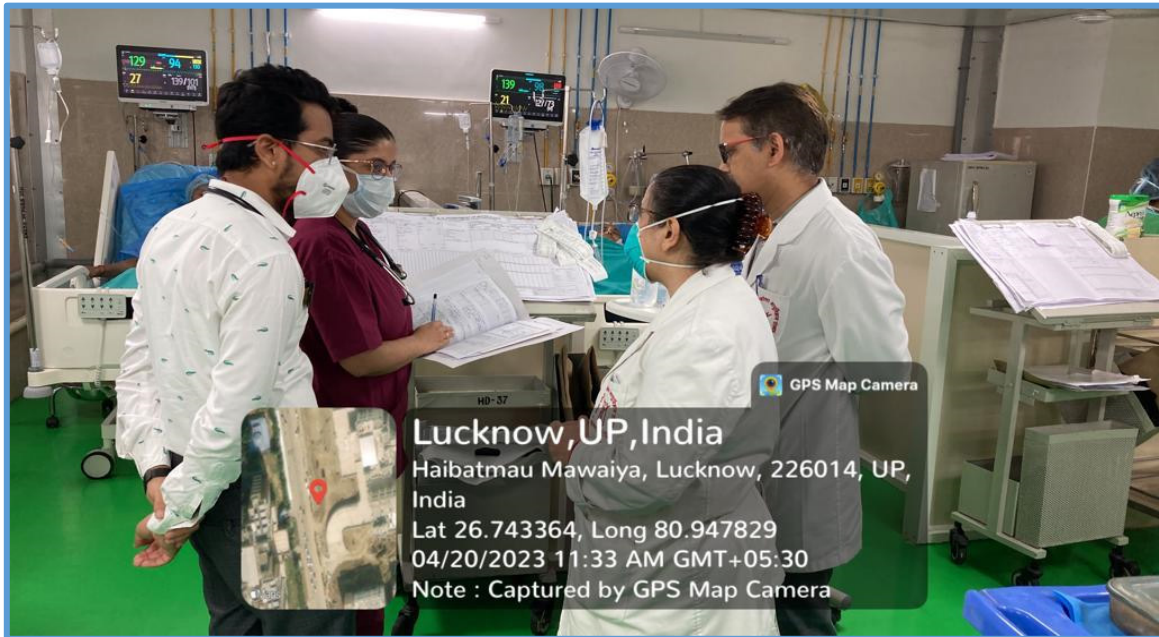
Bedside case discussion in ICU for teaching and learning