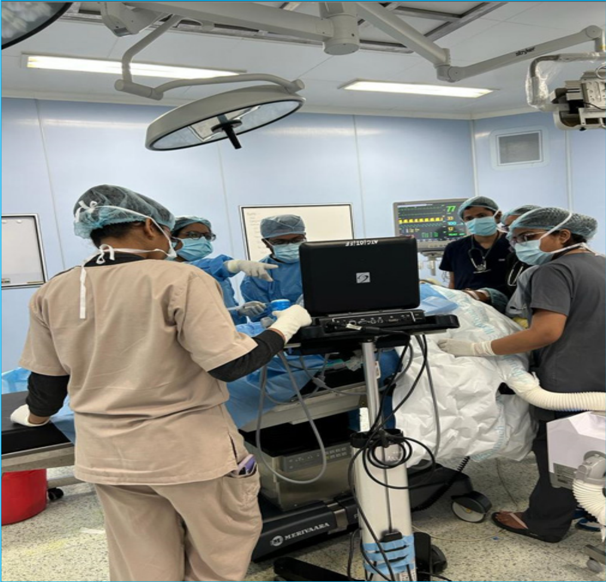
Interactive learning using Ultrasound for operative patients in OT