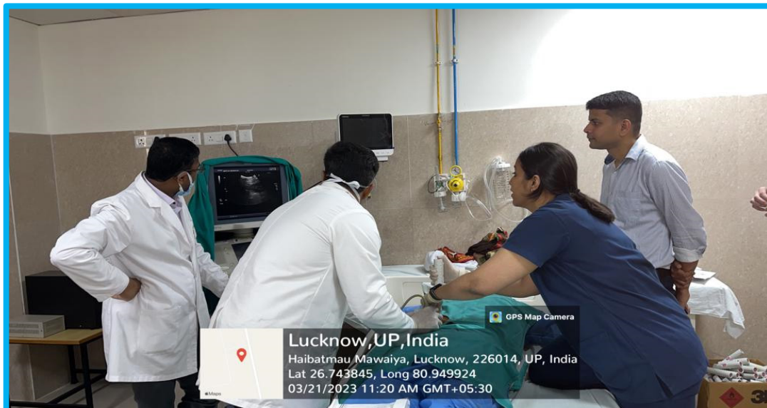
Residents learning about intervention using ultrasound under the guidance of faculty for patient management