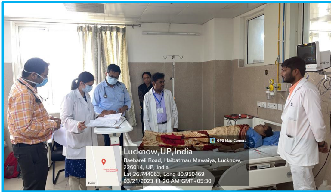
Bedside teaching-learning through case discussion in IPD